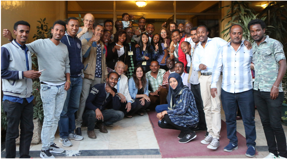
Figure 3. ISYA students and lecturers at the entrance of a hotel in Addis Ababa, Ethiopia, for the ISYA 2017. Notice the toddler at the back, son of one of the female students, being held by one of the lecturers. Two other female students declined joining the school due to insufficient means to care for their babies while they attended the school.

Engvold, O. 2018, IAU's Interaction with Young Astronomers , this volume